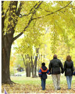
ROAD TO FITNESS