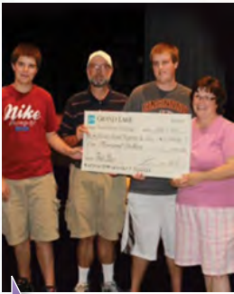
THE GRAND HEALTH CHALLENGE