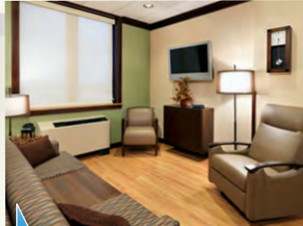
LIVING ROOM / MEDIA CENTER