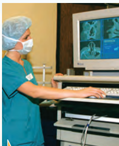
NEW EQUIPMENT AND SERVICES