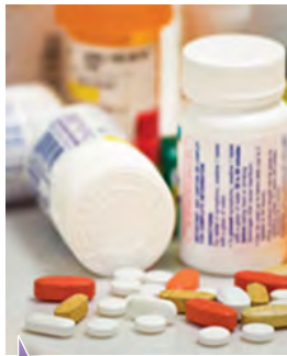
DRUG BUY-BACK PROGRAMS