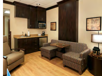
LIVING ROOM / KITCHENETTE