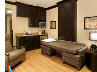
COUCH CONVERTS TO BED