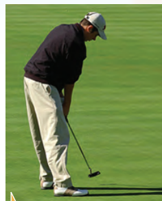
ANNUAL GOLF CLASSIC